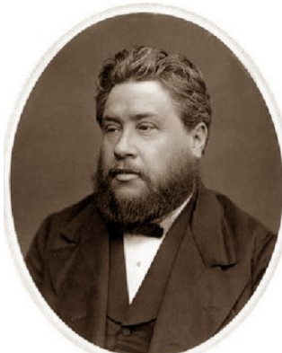
Charles H. Spurgeon