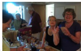
Bag Ladies Plus One